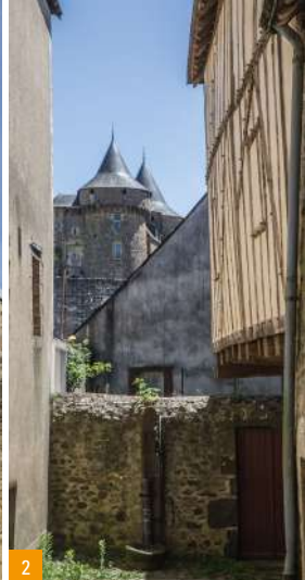
1. Roman gable on Saint-Etienne Square / 2. Puits-Vallas alleyway and its half-timbered house