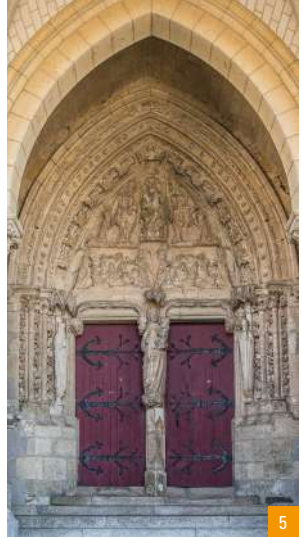
3. Sillé Castle / 5. The gothic portal of Notre-Dame-de-l'Assomption church